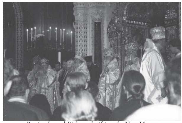
Patriarchs and Bishops glorifying the New Martyrs

Among those on the list of universally canonized saints were about 1,100 new martyrs, killed for their faith during the Soviet regime. Although it is widely acknowledged that there have been hundreds of thousands of martyrs, only those on whom the Synodal Commission was able to collect relatively