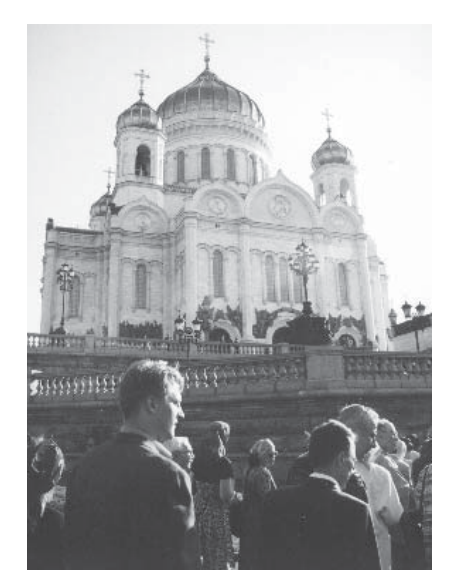
Christ the Saviour Cathedral in Moscow